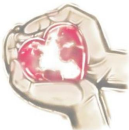
Social Action Ministry

Our usual annual room renovation project at the Family Emergency Center has been postponed to next spring in order to accommodate our effort to support the homeless shelters participating in winter shelter rescue project in Marin County. We will be joining with other churches to provide evening meals and company on a regular basis for shelter occupants during the cold and rainy winter season. The respite system is currently in the planning stage. Our Social Action committee will let everyone know more about our participation on Sunday, October 9 th – Please Stay Tuned.