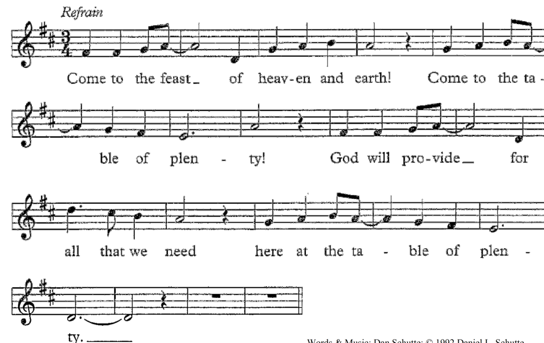
TABLE OF PLENTY

Words & Music: Dan Schutte; © 1992 Daniel L. Schutte